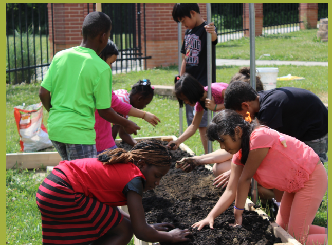
Students at Omaha's Fontenelle Elementary prepare the soil for planting in their newly-built hoop house.

Caritas Kids' Cottage | Bellevue, NE AHSTW | Avoca, IA Riverside Community School | Carson-Oakland, IA Bennington UMC | Bennington, KS Bonner Springs UMC | Bonner Springs, KS First UMC | Wahoo, NE Nelson Mandela Elementary | Omaha, NE Psalms Child Care Ministry | Omaha, NE Little Blessings Learning Center #2 | Omaha, NE Blackburn High School | Omaha, NE Burke High School | Omaha, NE Fontenelle Elementary | Omaha, NE Element Learning Center | Omaha, NE Montessori Learning Home | Omaha, NE Learning Community of South Omaha | Omaha, NE Lollipop Patch Child Care and Pre-school | Omaha, NE Franklin Elementary/Refugee Empowerment Center | Omaha, NE